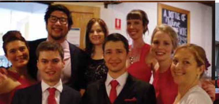
4 HOSPITAL BALL 2015

4 The 2015 Toowoomba Hospital ball raised funds to purchase equipment for the paediatric area of the emergency department. Just over $700 was raised, with the Resident Medical Officer society bumping the total up to $2000.