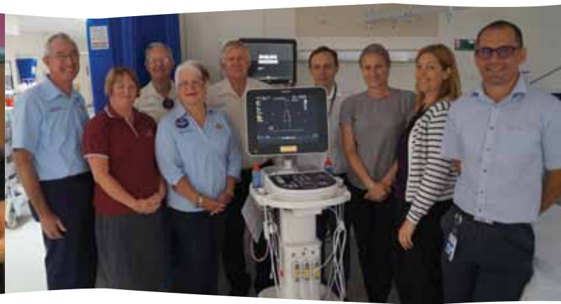
ABOVE THE NEW ULTRASOUND FOR OUR CRITICAL CARE WARD