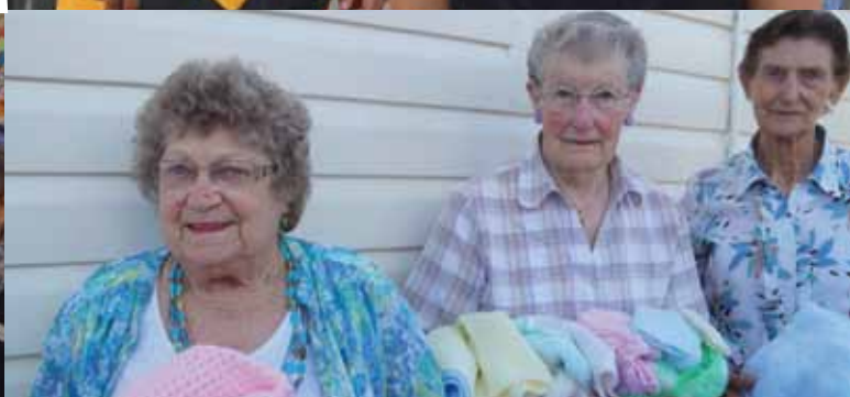
9 FREEDOM LADIES DONATING CRAFT ITEMS