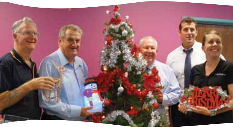
ABOVE BEN ROBERTS-SMITH OPENED THE 2015 WONDERLAND

Over the past 13 years, Toowoomba's Christmas Wonderland has resulted in close to $750,000 being donated to community groups and charities across the region. The three main beneficiaries are the Foundation, Toowoomba Hospice and Lifeline Darling Downs and South West Queensland.