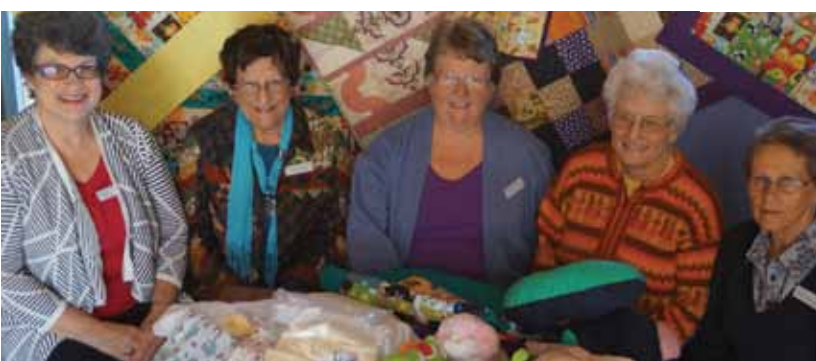
10 QUILTERS ASSOCIATION