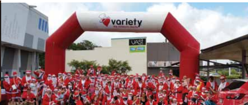
5 SANTA RUN

5 December saw hundreds of 'Santas' walking, running and skipping around Middle Ridge, raising $4140 for the paediatric area of the Toowoomba Hospital emergency department. The inaugural Variety Santa Fun Run was held in partnership with the Rotary Club of Toowoomba South.