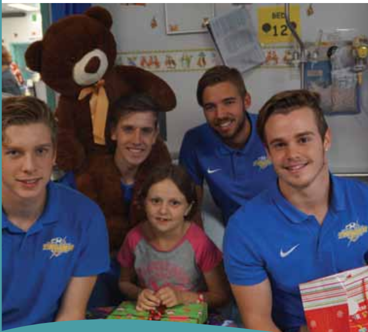
SWQ THUNDER SPREAD CHRISTMAS CHEER IN OUR CHILDREN'S WARD