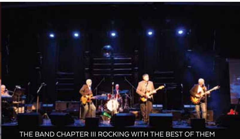
THE BAND CHAPTER III ROCKING WITH THE BEST OF THEM

JB's presents: The Wonder Years was a year-long project that included the production of the 'Toowoomba's Wonder Years 1950-75' historical compilation book, the launch of a new CD single titled 'Here We Go Again, My Friends', and culminated in a rock 'n' roll concert attracting nearly 1000 people.