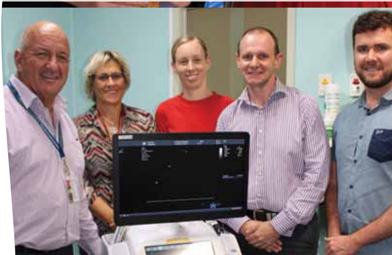
7 ECHOCARDIOGRAPH DONATION